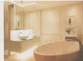
Red draw: The cinema (top) is great for cosy nights in while the bathroom (above) has a relaxed feel typical of the house