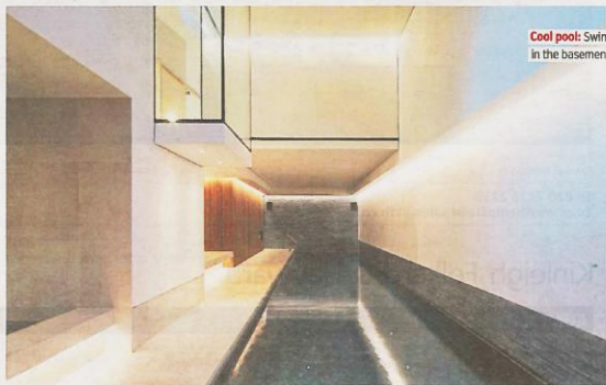
Cool pool: Swim in the basement