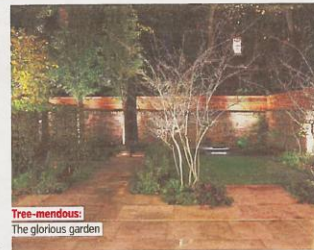
Tree-mendous: The glorious garden