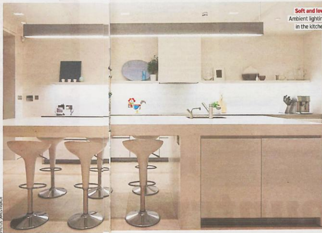
Soft and low: Ambient lighting in the kitchen

'It's just a really cool thing to have,' laughs Lee, who clearly has a great eye for design, but doesn't take herself too seriously. Included in this downstairs area is a gym and a cinema room with dark grey velvet finishes. A large clerestory window brings natural light into the room, while aspen panels add a further natural feel to the space. While the lighting is designed to